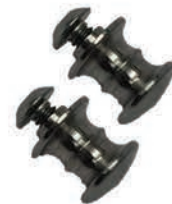
CM5020 Finger Pins (Set of 6)