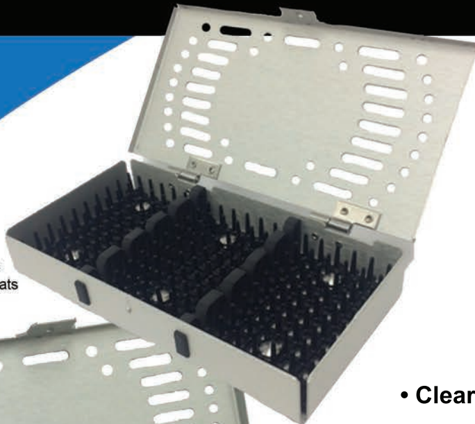
CM5000 Case with silicone brackets, finger mats and pins